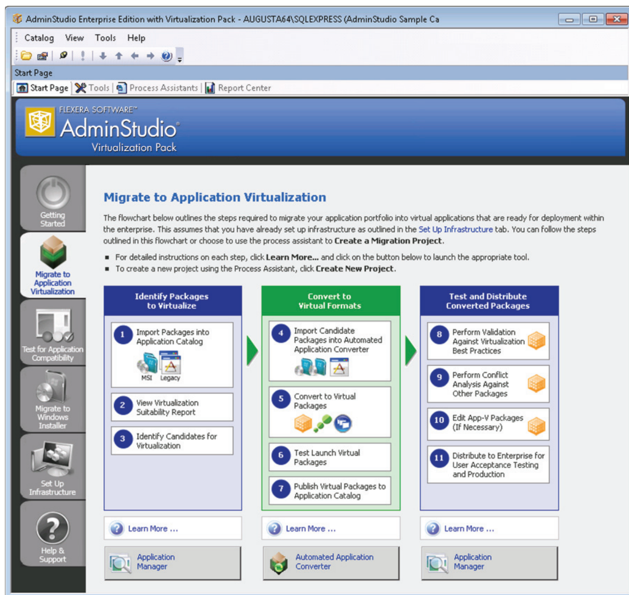
Figure 1.3: AdminStudio Application Virtualization Workflow

It automates the conversion of MSIs and legacy installers to virtual application formats, ensuring a consistent approach that is up to 9 times faster than using native tools, reducing the cost and duration of a migration project.